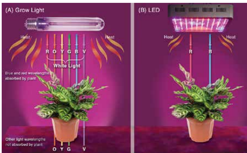
Figure 1. (A) A traditional grow light, which is used to grow crops underground, emits light from the entire visible spectrum, even though many crops absorb only portions of the visible spectrum. A green plant—such as the one shown here—typically absorbs wavelengths that are only in the blue and red regions of the visible spectrum. Also, grow lights emit a lot of heat. (B) A LED lamp saves energy because it generates only the wavelengths of light the crops actually absorb, and it emits less heat than grow lamps.

LEDs also are less costly than grow lamps and produce little to no heat and can be placed next to a leaf, which allows crops to be closely stacked on top of each other.